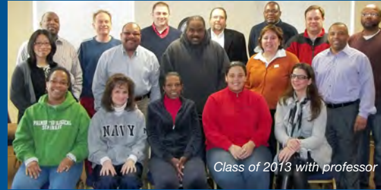
Class of 2013 with professor

The Doctor of Ministry in Leadership of Missional Church Renewal affirms a vital relationship with Jesus Christ as the source of a renewal that connects people with the mission of the church. It looks inward at the transformation of leaders and churches, and outward at the transformation of communities and the world. In short, it captures the essence of what it means to be the church and prepares students to become leaders of change.